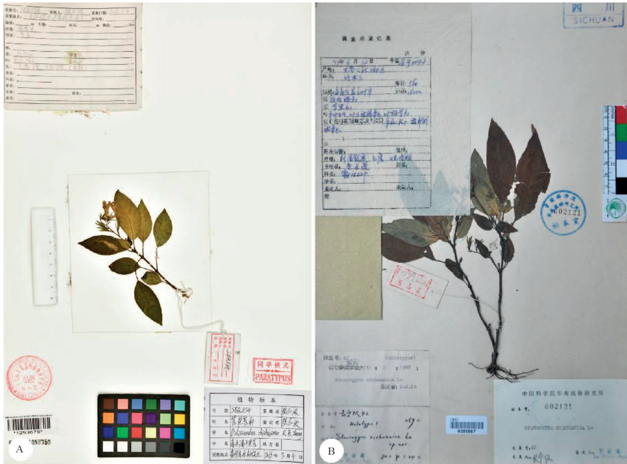
Fig. 1 Images of type material. A: Isotype of Didissandra chishuiensis ; B: Holotype of Staurogyne sichuanica .

Shi, Hushi Zhen, Jinsha Cun, 28.461° N, 105.980° E, 530 m, 4 March, 2013, R. B. Zhang SBQ034 (holotype, ZY; isotype KUN!).