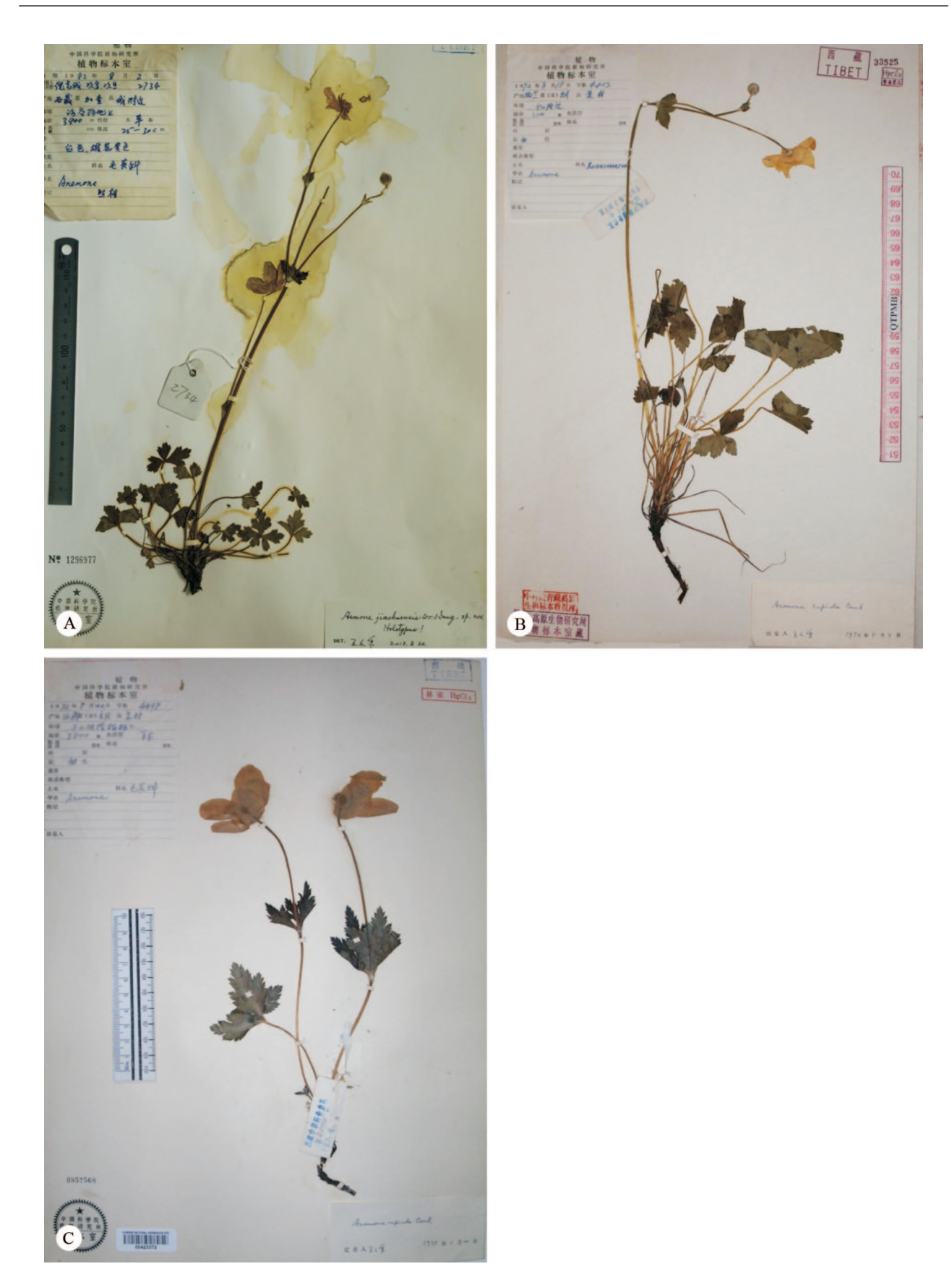
Fig. 1 Specimens of Anemone tibetica (A, B) and A. rupicola (C). A: Z. C. Ni et al. 2734 (holotype of A. jiachaensis , PE), Jiacha (=Gyaca), Xizang, China; B: Xizang Herb. Med. Exped. 4423 (isotype of A. tibetica , HNWP), Langxian, Xizang, China; C: Xizang Herb. Med. Exped. 4498 (PE), Langxian, Xizang, China.