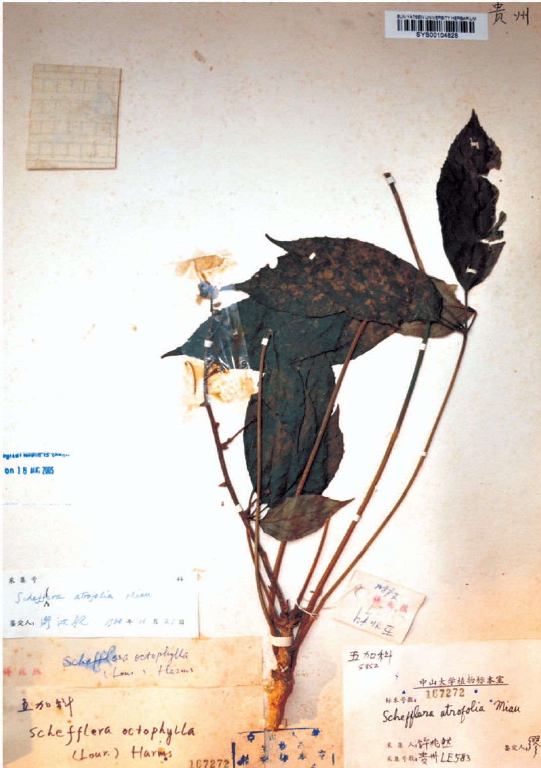
Fig. 1 Type of Schefflera atrifoliata R. H. Mian

simultaneously published a new species, Brassaiopsis pentalocula G. Hoo (Fig. 1) for this taxon in Brassaiopsis .