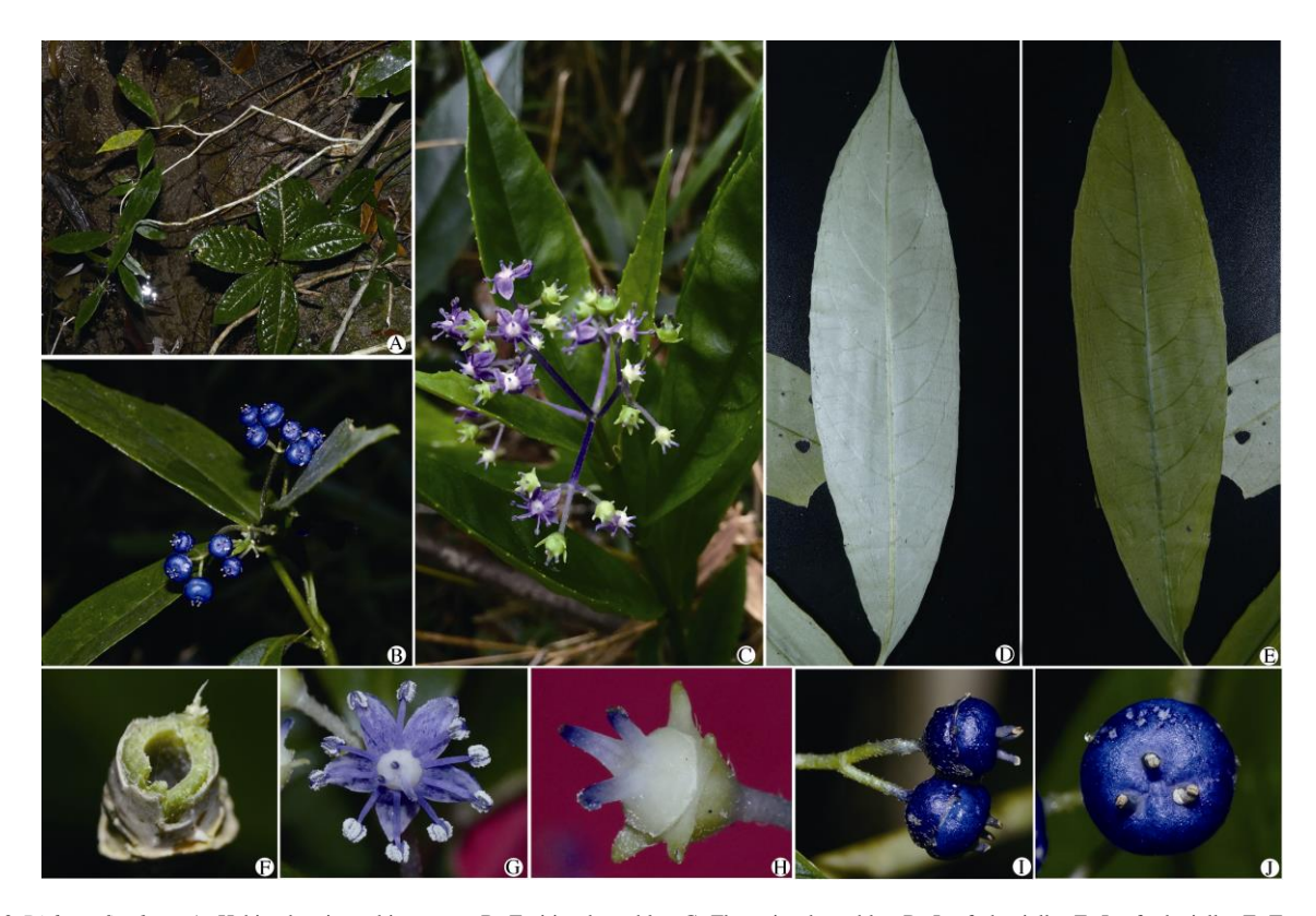
Fig. 2 Dichroa fistulosa . A: Habit, showing white stems; B: Fruiting branchlet; C: Flowering branchlet; D: Leaf abaxially; E: Leaf adaxially; F: Transverse plane of stem; G: Frontal plane of flower; H: Flower without petals and stamens; I: Profile plane of berries; J: Frontal plane of berry.

deep purple spot, ovate, ca. 2.5 mm, glabrous, apex acute. Stamens 10; filaments filiform, 2–2.5 mm; anthers ovoid-ellipsoid. Ovary semi-inferior. Styles 3(-4), robust, 1–1.5 mm; stigma small. Berry blue, subglobose, ca. 6 mm, pubescent or glabrous. Seeds ellipsoid. Flowering from May to June, fruiting from December to January.